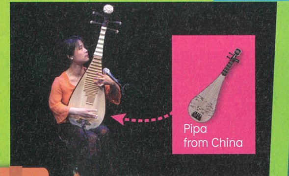
Pipa from China