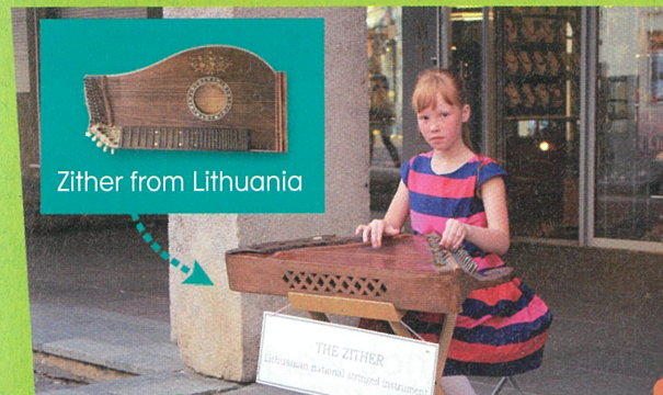
Zither from Lithuania