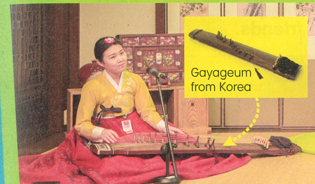
Gayageum from Korea

There are many different string instruments from around the world. They all look different, and they all make beautiful sounds.