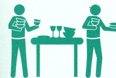
clear the table