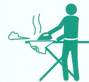
iron a shirt