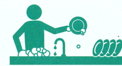
do the dishes (US) wash the dishes (UK)