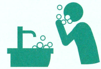
wash your face