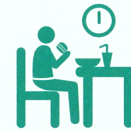
have lunch / eat lunch