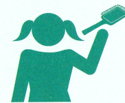
brush your hair