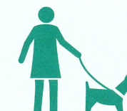
walk the dog