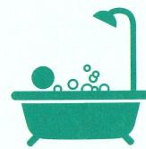
take a bath (US) have a bath (UK)