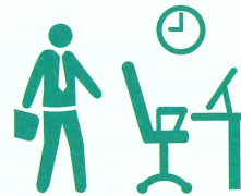
go to work