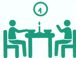
have dinner / eat dinner